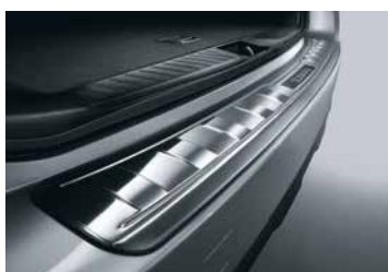
CARGO STEP PANEL (STAINLESS)