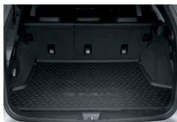
CARGO TRAY (LOW DISH)