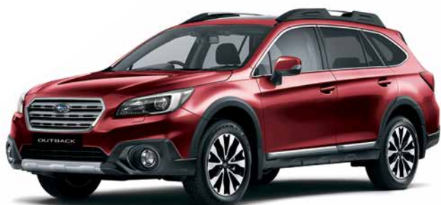
VENETIAN RED PEARL