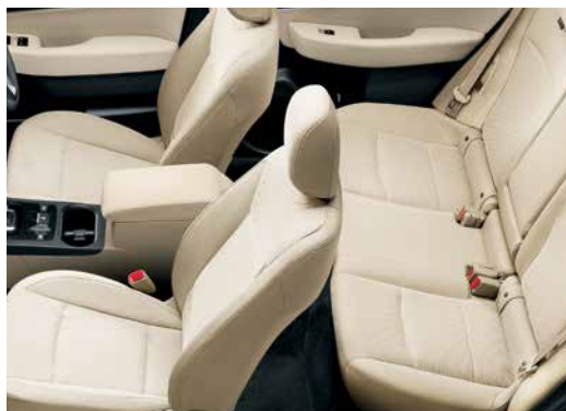
IVORY OR BLACK: Cloth 6 (textured): Outback 2.5i - available in a choice of black or ivory