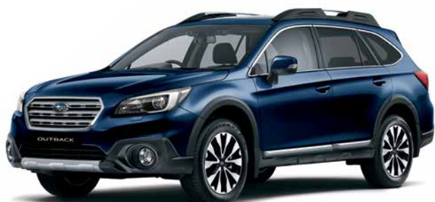
LAPIS BLUE PEARL