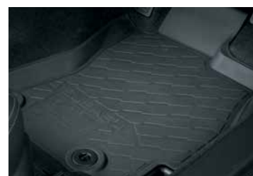
RUBBER FLOOR MAT SET