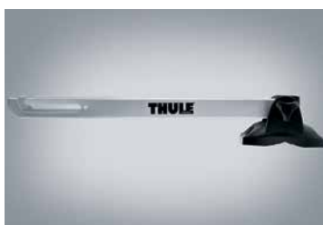
THULE FRONT WHEEL CARRIER - ROOF MOUNTED