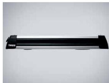
THULE UNIVERSAL FLAT TOP (SKI CARRIER, 6 PAIRS. 4 PAIR AVAILABLE)