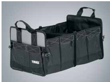
THULE GO BOX