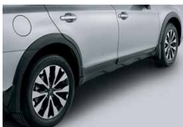
WHEEL ARCH MOULDING SET (2.5I & 2.0D ONLY. STANDARD ON 2.5P, 3.6R & 2.0D-P)