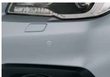
FRONT CORNER PARK ASSIST SENSORS