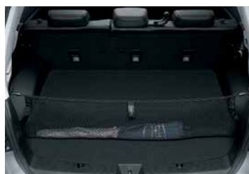
CARGO ROOM NET (REAR TAILGATE)