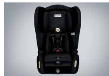
BABY SEAT - INFASECURE 2