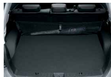
CARGO ROOM NET (REAR SEAT BACK)