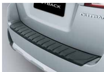
CARGO STEP PANEL (RESIN)