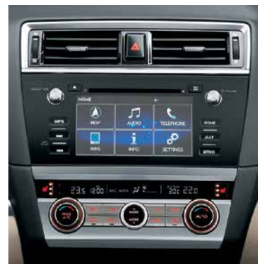
INTEGRATED INFOTAINMENT FEATURING SATELLITE NAVIGATION: Outback 2.5i Premium, Outback 3.6R and Outback 2.0D Premium