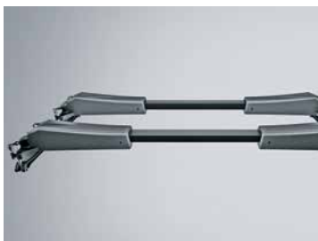
THULE BOARD SHUTTLE (STANDUP PADDLE BOARD / SURFBOARD CARRIER)