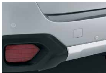
REAR PARK ASSIST SENSORS