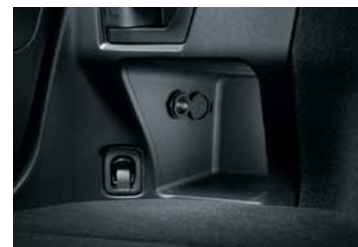
CARGO SOCKET KIT (12V)