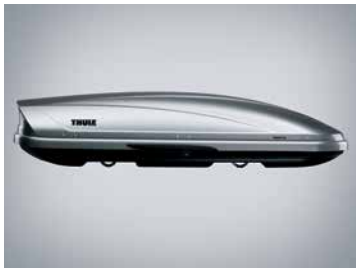
THULE MOTION XL (800) ROOF BOX (SILVER GLOSS OR BLACK GLOSS)