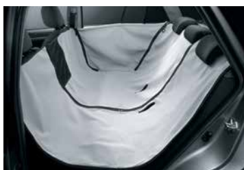
REAR SEAT PROTECTOR (DESIGNED FOR DOG OWNERS)