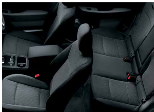
BLACK: Cloth 6 : Outback 2.0D - available in black only