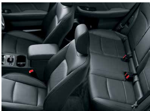
BLACK: Leather 7 : Outback 2.5i Premium, Outback 3.6R and Outback 2.0D Premium