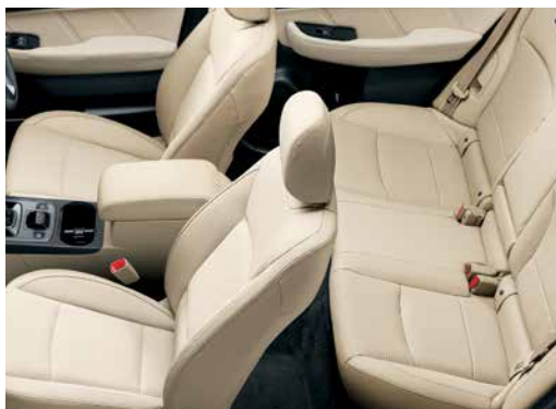
IVORY: Leather 7 : Outback 2.5i Premium, Outback 3.6R and Outback 2.0D Premium