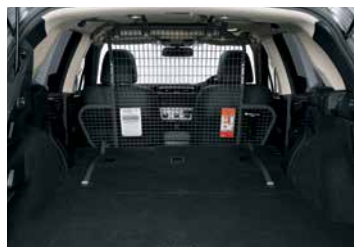
CARGO BARRIER (FORWARD MOUNT BRACKET KIT)