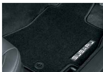
CARPET FLOOR MAT SET