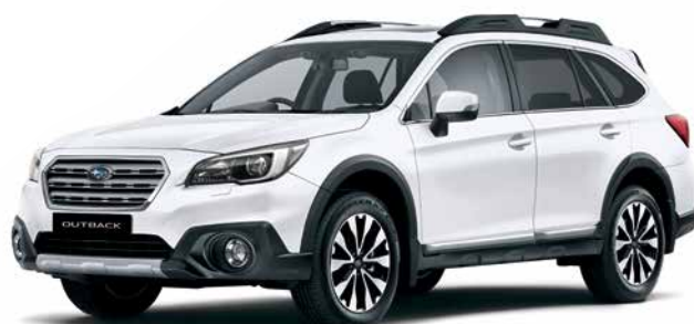
CRYSTAL WHITE PEARL