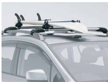
THULE WAVE SURF CARRIER (SURFBOARD CARRIER) 2