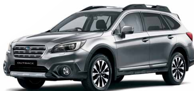
PLATINUM GREY METALLIC