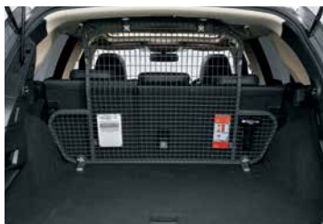
CARGO BARRIER (REAR MOUNT)