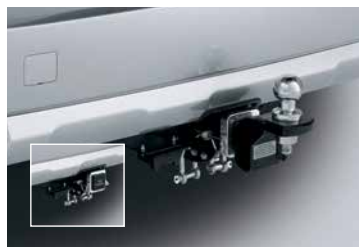
TOWBAR KIT AND BLANKING PLUG