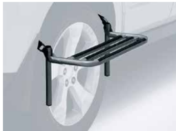
THULE STEP UP WHEEL STEP (PROVIDES EASY ACCESS TO ROOF MOUNTED ITEMS)