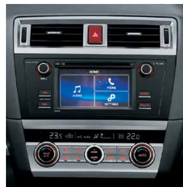
INTEGRATED INFOTAINMENT: Outback 2.5i and Outback 2.0D