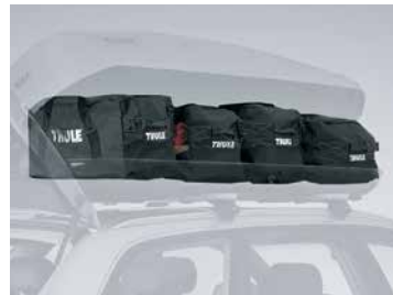
THULE GO PACK SET (4 BAGS)

1. Subaru Australia reserves the right to vary vehicle specifications, accessory range and standard features in Australia from those detailed in this brochure. Vehicles shown in this brochure may be fitted with accessories available at additional cost. For full warranty, pricing and applicability information visit us at subaru.com.au . 2. Thule product shot Subaru XV, vehicle specifications differ to Outback.