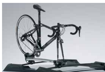
THULE SPRINT BIKE CARRIER - ROOF MOUNTED (FORK MOUNT)