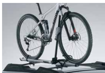
THULE SIDEARM BIKE CARRIER - ROOF MOUNTED