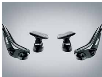
THULE GLIDE & SET (KAYAK CARRIER)